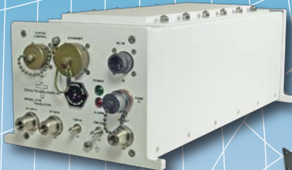
Weatherized/Multi-Band Frequency Converters