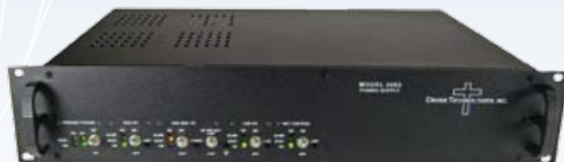
Power Supplies Sources, Inserter