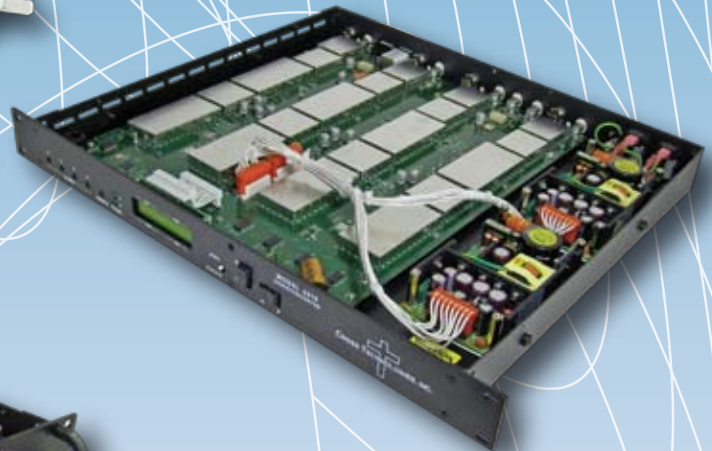
Multi-Channel Up/Downconverters and AGC Amplifiers